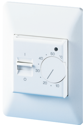
Scale in °C