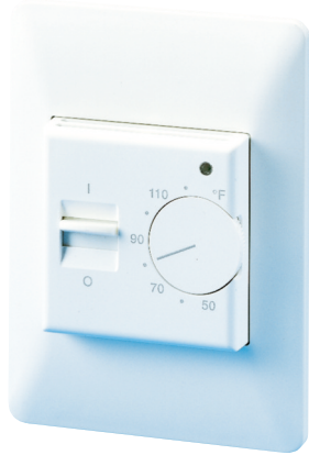
Scale in °F