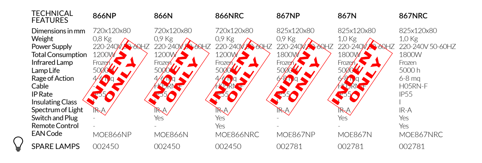
866NP | 866N | 866NRC